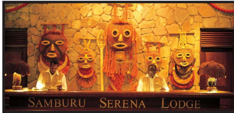
Faces of Samburu